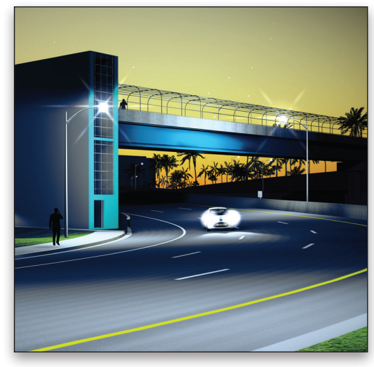
OpenRoads helped with modeling and design, creating an innovative design for better project visualization and engaging marketing material.

Another way that AECOM improved project visualization was by implementing civil infrastructure information modeling (CIIM). This practice allowed the team to visualize the potential designs and measure performance features, such as sight lines and vehicular clearances. Performing these analyses during the design phase was crucial to keep the project on schedule and meet client demands. CIIM is also leading the organization-wide effort of going digital, implementing more digital technologies into its workflows.