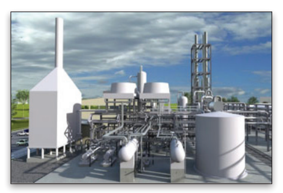
Produce lifelike renderings and animations to improve communications and speed approvals.

Easily share and consume precise data in key industry formats such as Autodesk®, RealDWG ^{\text{\tiny{M}}} , IFC, Esri SHP, and more.