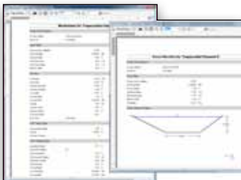
Manage data easily using the Project Explorer and engineering libraries